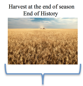
Wheat Harvest 2<sup>nd</sup> Resurrection